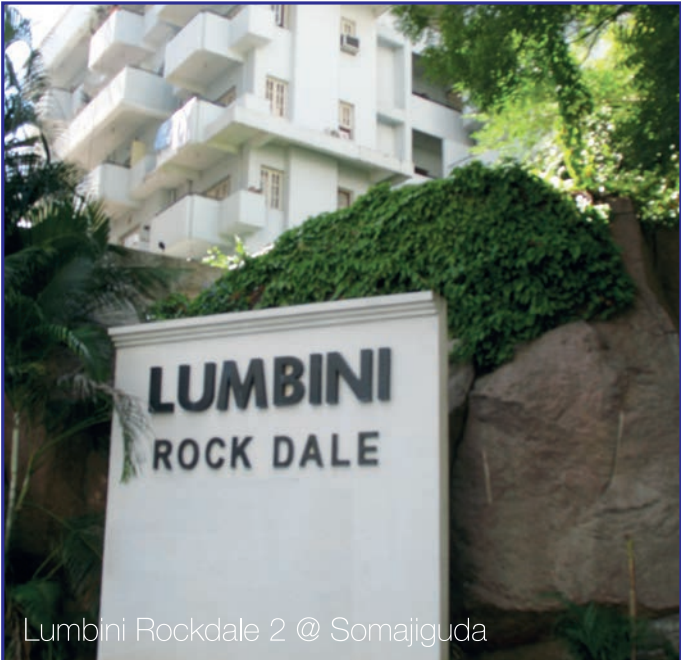
Lumbini Rockdale 2 @ Somajiguda