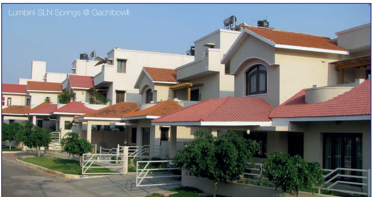
Lumbini SLN Springs @ Gachibowli